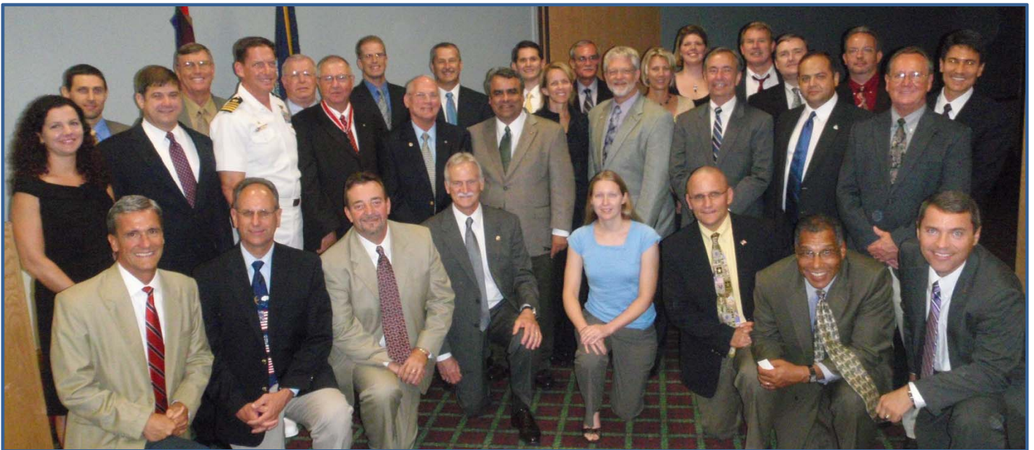
Newly inducted officers and director for 2011-12 term.