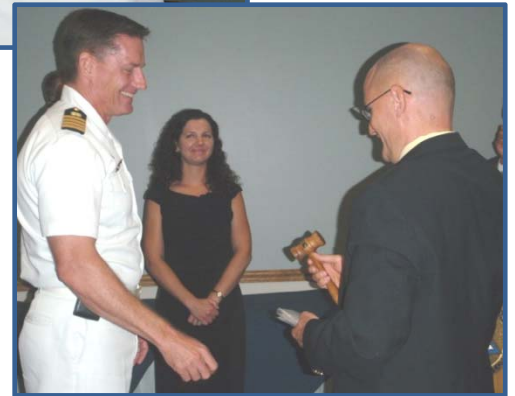
Right: The official passing of the gavel.

SAME and the importance of helping each other within the Post as well as the community, to stay on top.