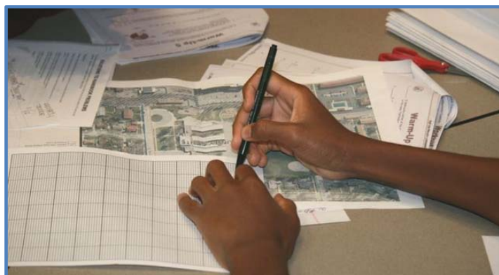
A close view of one of the site plans.